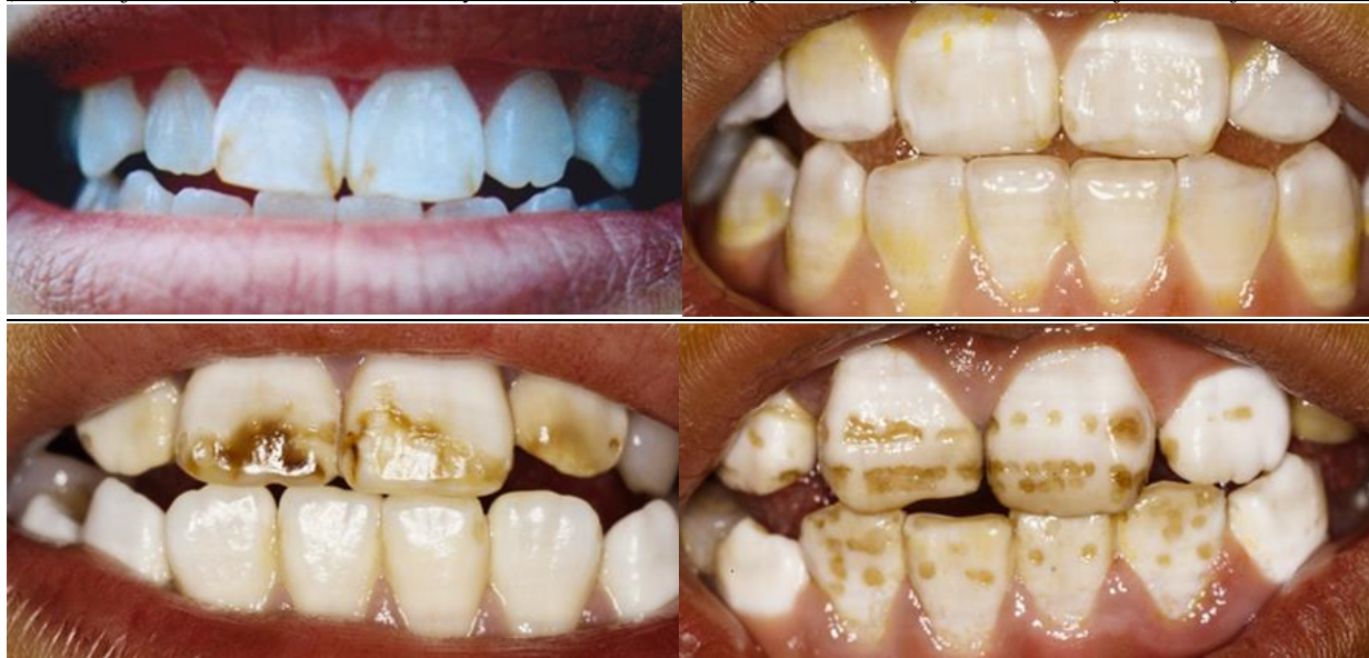
Figure 1: Dental Fluorosis Ranging from Very Mild to Severe

Exposure to excess fluoride in children is known to result in dental fluorosis, a condition in which the teeth enamel becomes irreversibly damaged and the teeth become permanently discolored, displaying a white or brown mottling pattern and forming brittle teeth that break and stain easily. 246 It has been scientifically recognized since the 1940's that overexposure to fluoride causes this condition, which can range from very mild to severe. According to data from the Centers for Disease Control and Prevention (CDC) released in 2010, 23% of Americans aged 6-49 and 41% of children aged 12-15 exhibit fluorosis to some degree. 247 These drastic increases in rates of dental fluorosis were a crucial factor in the Public Health Service's decision to lower its water fluoridation level recommendations in 2015. 248